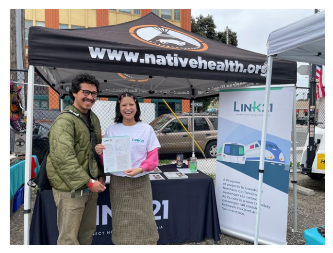
Link21 outreach staff posing with an attendee at the Native American Health Center's Indigenous Red Market in Oakland, March 2023.

During the first quarter of 2023, the Team presented and engaged virtually with two youth advocacy groups: the UC Berkeley Parking, Transportation Mobility and Equity Committee, and the Oakland Youth Commission. These presentations included a Link21 Program overview followed by a question-and-answer session where attendees were able to learn about the Program, and provide feedback on how Link21 can better serve and involve future generations throughout the Megaregion.