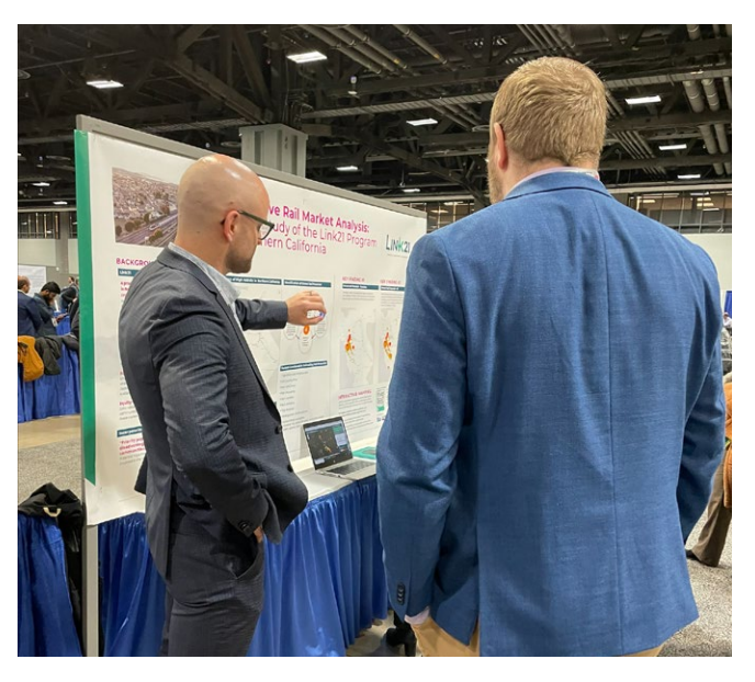
Link21 consultants presenting Market Analysis results in a Transportation Research Board national conference poster session in Washington, DC., January 2023.

Link21 presented to a broad range of stakeholder groups in the first few