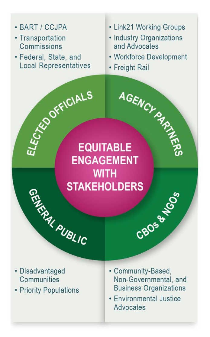
Link21 Engagement and Outreach Strategies