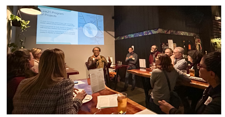
The Link21 Team presented to the Dogpatch Neighborhood Association in San Francisco on Nov. 11, 2023.

The Link21 Team created a logo and coaster for the Transit on Tap event hosted for Bay Area transportation advocates in Oakland on Oct. 25, 2023.